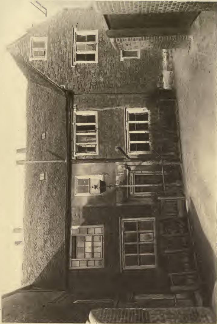
The Quarry House, Salisbury